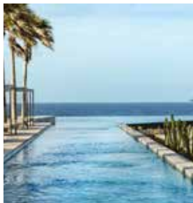
Pref. Club Master Ste Ocean View King