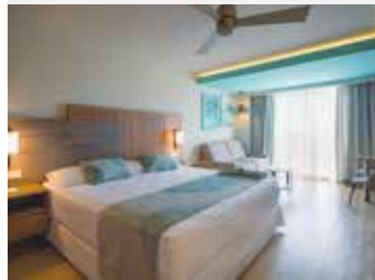
Junior Suite Standard