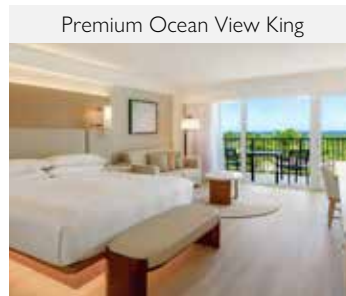
Premium Ocean View King

Overlooking the Caribbean Sea and the white sandy beaches of Palm Beach, this beautifully styled resort offers spacious accommodations with exceptional amenities. Try your luck at the thrilling 24-hour Stellaris Casino or take a long swim in tranquil ocean waters. Sip on specialty cocktails in private cabanas at the H2Oasis adults-only pool or pamper yourself with a soothing massage at Mandara Spa. Savor superb on site dining at Ruth's Chris Steak House, Atardi, and Mercát. In the evening, retreat to newly renovated guest rooms, thoughtfully redesigned to blend modern comfort with authentic Caribbean charm, featuring plush designer bedding, private balconies, and picturesque views. Upgrade to the adult-only Tradewinds Club and receive five complimentary food and beverage servings throughout the day; reserved beach area; private check-in; concierge and unpacking services; and more. AAA Four Diamond.