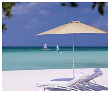
Ocean Front Room