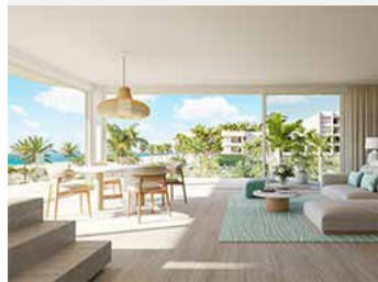
Ocean Front Royal Butler Ste King

Recently opened, you'll find the spectacular JOIA Aruba by Iberostar right on Eagle Beach; it's located in an extraordinary enclave in the Southern Caribbean and boasts exceptional service. Imagine taking a swim in the infinity pool while looking out at the spectacular views of the area or unwinding at the pool bar without having to leave the pool. Relax with a spa session and try out the culinary offerings at the spectacular buffet and the two specialty restaurants, as well as the four bars and Star Café. You'll find activities for everyone both at the hotel and nearby. You can play golf at Tierra del Sol—Aruba's only professional 18-hole golf course, designed by Robert Trent Jones II—discover its idyllic beaches, or unwind in the hotel's luxurious facilities.