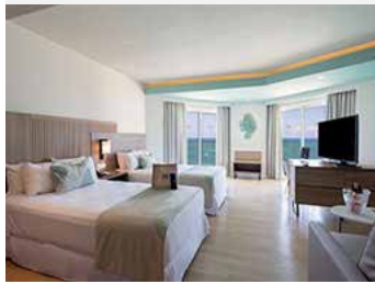
Junior Suite Elite Club