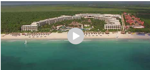
Preferred Club Junior Suite Ocean Front