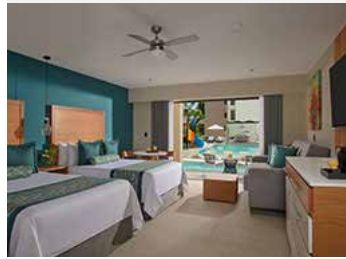
Pref. Club Jr. Ste Swim Out Pool View