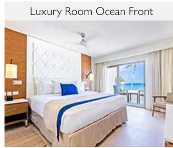
Luxury Room Ocean Front

Premium bottle of wine valued at $40 per room. Valid in all non-Diamond Club room categories for 3-night minimum stays on 2026 bookings traveled by 6/30/27.