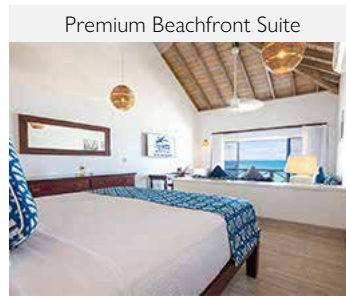
Premium Beachfront Suite

Galley Bay Resort & Spa is a magical oasis that drifts you away into a world of relaxed luxury. This award-winning resort is cherished for its authentic reflection of Caribbean hospitality. It combines the perfect ingredients of vibrant sunsets, lush gardens, sweeping beach, and protected lagoon, making it a magical hideaway exclusively for adults.