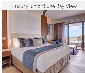
Luxury Junior Suite Bay View

Indulge in a luxurious escape with exceptional service, stylish architecture, and eclectic and delectable food. Set on a stunning private beach next to breathtaking clear waters, soft trade winds blow under the watchful eye of historic Fort Barrington, which overlooks the hotel and Deep Bay. From unlimited à la carte dining to the signature DreamBed™, all has been carefully designed to deliver personalized service. Choose from the Resort or Diamond Club™ sections, and experience the perfect vacation, tailored just for you.