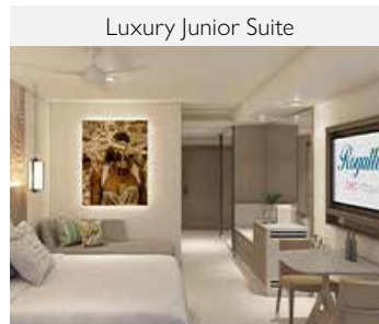
Luxury Junior Suite